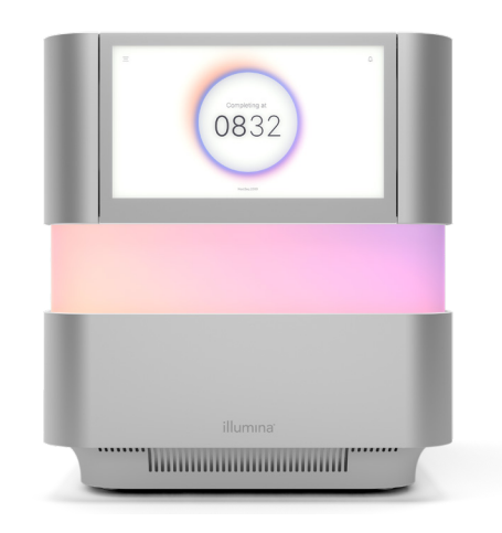
Figure 1: NextSeq 1000 and NextSeq 2000 Sequencing Systems— The NextSeq 1000 and NextSeq 2000 Systems harness XLEAP-SBS chemistry to streamline sequencing workflows.